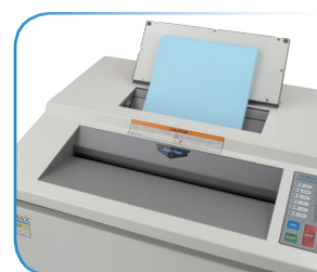
AutoFeeder holds up to 175 sheets. Load, press start and walk away!