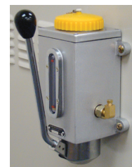
Optional EvenFlow™ reservoir and pump