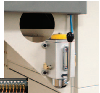
EvenFlow™ reservoir and pump

The FD 8902B features the EvenFlow™ Automatic Oiling System to keep the shredder in peak operating condition. The easy-to-use pump combines with 25 copper distribution nozzles to lubricate the steel cutting blades.