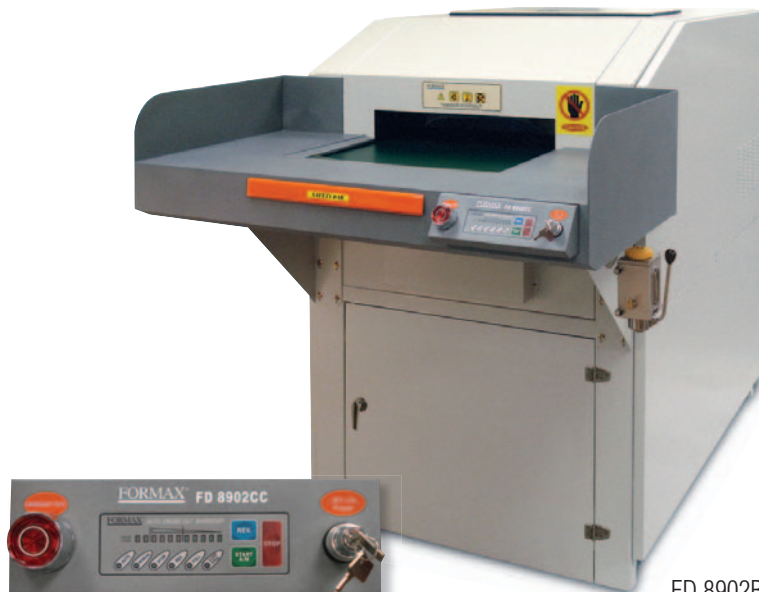
LED Control Panel with Load Indicator