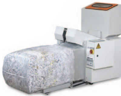
FD 8902B with full bale

The FD 8902B features a powerful high-capacity Output Baler which continually compacts shredded material into a bale, which improves throughput capacity by minimizing the frequency of unloading the shredder. Sensors automatically stop the shredding mechanism when the baler is full. The FD 8902B is the ultimate solution for high-capacity centralized shredding.