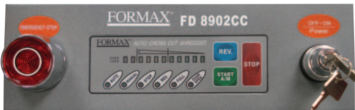
LED control panel with visual load indicator and safety key lock

The FD 8902B offers unmatched automated features through its LED control panel. The easy-to-read Load Indicator assists operators in determining how close they are to the maximum shred capacity to avoid jams and provide optimal efficiency. Operators can select from two modes of operation: Auto Start/Stop or Manual. Auto Start/Stop mode utilizes optical sensors which detect paper and start/stop operation automatically. Manual mode provides non-stop operation for shredding small sized paper or films. The Safety Key Lock prevents unauthorized use of the shredder.