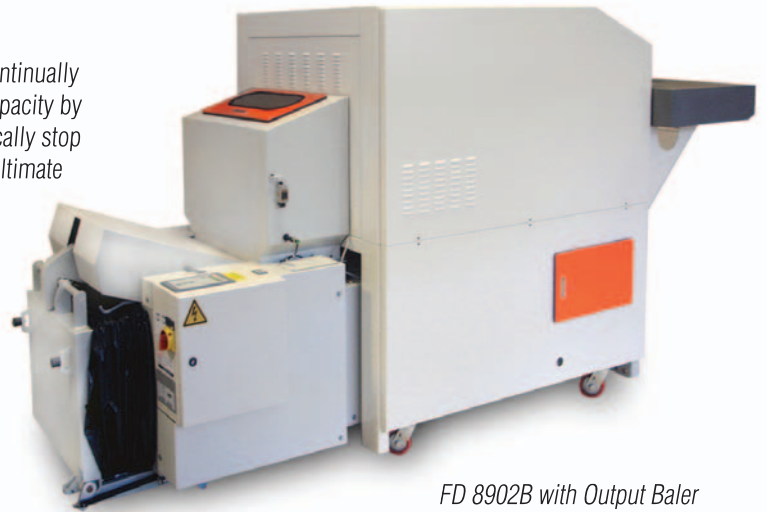
FD 8902B with Output Baler